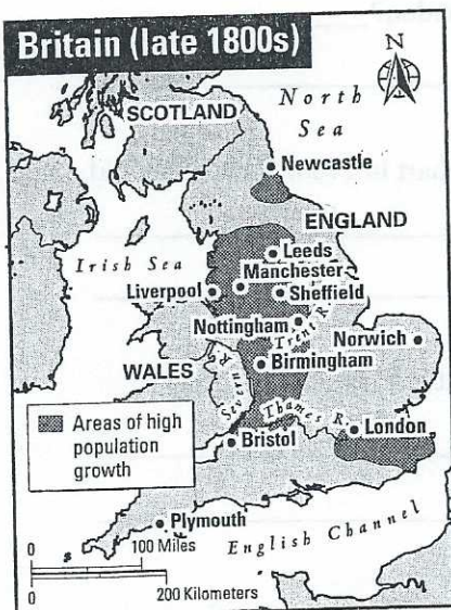
Growth of British Cities 1760-1881